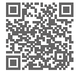
Datasheets MTP screens