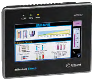
MTP6/50 MTP8/50 MTP8/70